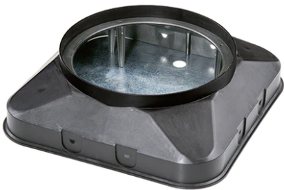
Box for Installation Cassiopea Round 73