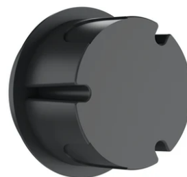
Box for installation F1318000