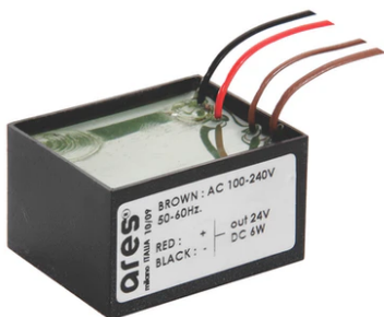
Power supply 24V 8W / 110-240V IP65 Class II selv. Non Dimmable RF25748