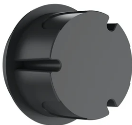
Box for installation F1318000