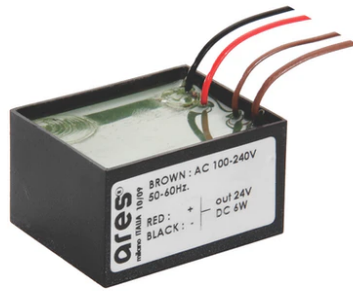
Power supply 24V 8W / 110-240V IP65 Class II selv. Non Dimmable RF25748