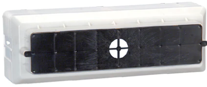
Box for Installation Camilla 300 124