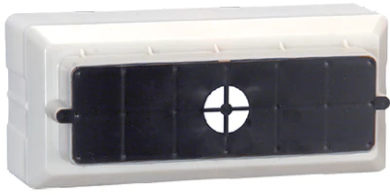
Box for Installation Camilla 230 123