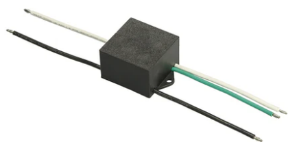
S.P.D. (SURGE PROTECTION DEVICE) F990E00A000