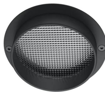
Spot visor with flood lens F001Z040000