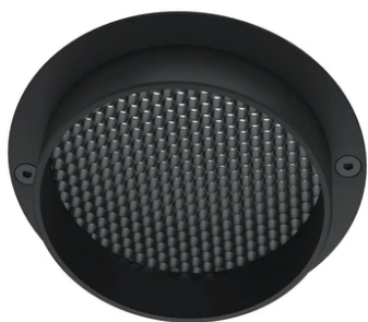
Spot visor with honeycomb F001Z030000