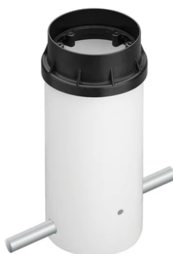
Box for ground installation F001Z020000