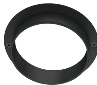
Spot visor F001Z010000