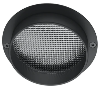
Spot visor with flood lens F001Z040000