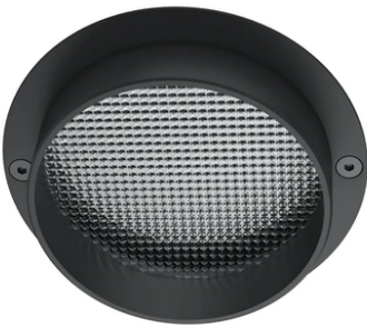
Spot visor with flood lens F001Z040000