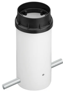
Box for ground installation F001Z020000