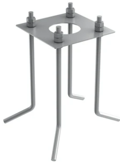
Base plate with bolt for Bellhop Pole with base version. F990G300000