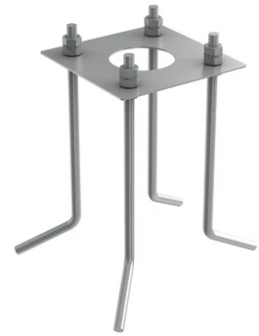
Base plate with bolt for Bellhop Pole with base version. F990G300000