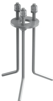
Base plate with bolt F003Z010000