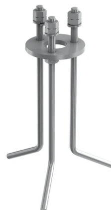
Base plate with bolt F003Z010000