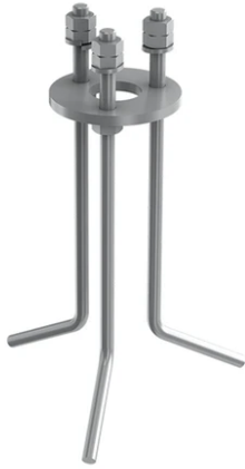
Base plate with bolt F003Z010000