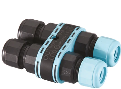
3/4 Way Terminal Block 4 Poles Ip68 H2O Stop 215