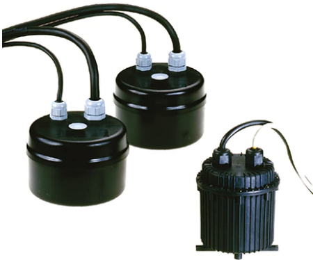
Transformer 200W 230V/12V 50Hz Ip66 17