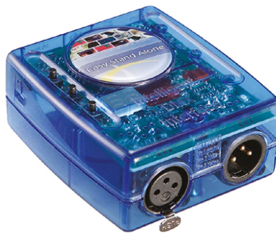
Dmx Controller Stand-Alone/Pc Interface 143