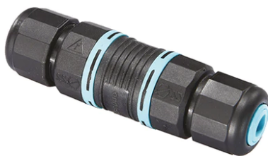
2 Way Terminal Block 4 Poles Ip68 H2O Stop 236