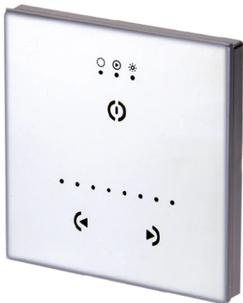
Dmx Controller Dimmer Switch For Recessed Box 142