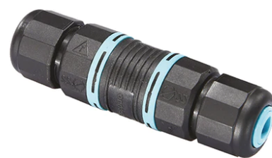
2 Way Terminal Block 4 Poles Ip68 H2O Stop 236