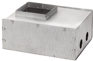
Box for Ceiling Recessed Installation Mini Ara 107