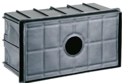
Box for Installation Alice 77