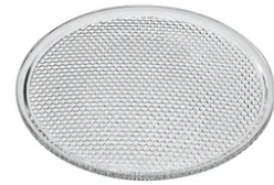
Flood lens 6 units Kit F4560000