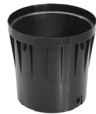
Box for installation F4599000