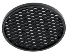
Honeycomb 6 units Kit F4557000