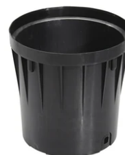
Box for installation F4599000