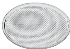
Flood lens 4 units Kit F4559000