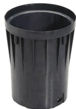
Box for installation F4598000