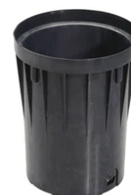
Box for installation F4598000