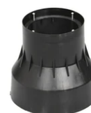
Box for installation F4597000