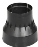
Box for installation F4597000