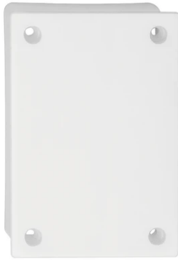
High comfort diffuser (opal) F0074071