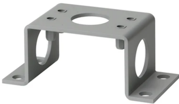
Flange to be cemented Grey F0058000