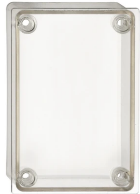
High performance diffuser (transparent) F0074000