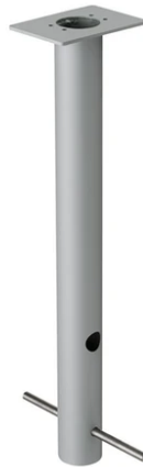
Pole to be placed in the ground Grey F0057000