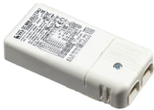
Continuous current power supply, Mains dimming, leading & trailing edge 220/240V – 50/60Hz, 300mA-14W / 350mA-17W / 400mA-19W / 450/500/600/650/700/750/800/900mA – 20W 60.9467