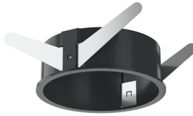
Installation Frame Trim 08.0161.14