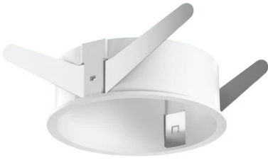
Installation Frame Trim 08.0161.40