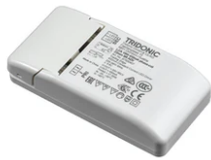
Continuous current power supply of 18W, 220/240V – 50/60Hz with 450 mA supply voltage Mains dimming, trailing edge 60.9268