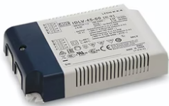
24V Remote power supply. Dimmable through 1/10V protocol or Non Dimmable. 25W 110/240V 60.9359