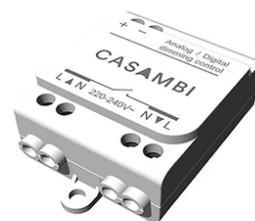
Casambi Controller 220-240V. Remote Installation 60.9392