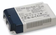
24V Remote power supply. Dimmable through 1/10V protocol or Non Dimmable. 25W 110/240V 60.9359