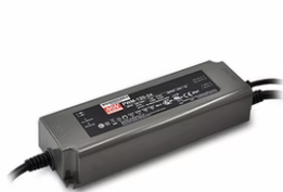
24V Remote power supply. Dimmable through 1/10V protocol. 120W 110/240V 60.9416