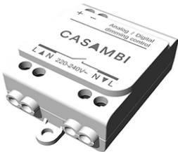
Casambi Controller 220-240V. Remote Installation 60.9392