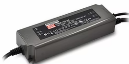
24V Remote power supply. Dimmable through DALI protocol. 120W 110/240V 60.9426