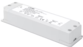
Remote Power Supply Non Dimmable 24V. 120W. 220/240V