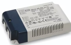
24V Remote power supply. Dimmable through 1/10V protocol or Non Dimmable. 25W 110/240V 60.9359