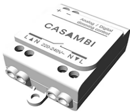
Casambi Controller 220-240V. Remote Installation 60.9392