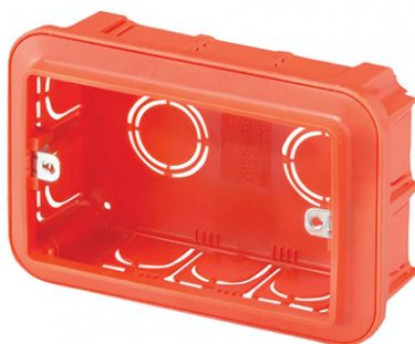
3-module flush mounted box for masonry 80.8067