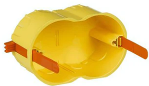
3-module flush mounted box for Pladur 80.8006