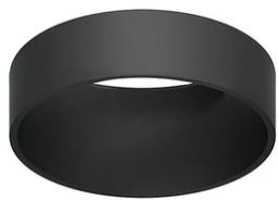
Holding ring 08.8410.00