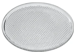
Flood lens 08.8175.68