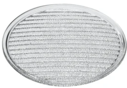
Elliptical lens 08.8163.68