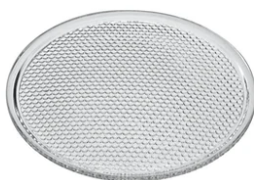
Flood lens 08.8175.68