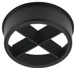
Holding ring 08.8410.00