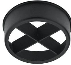
Holding ring 08.8410.00