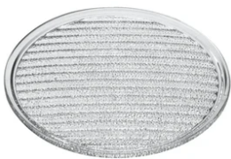
Elliptical lens 08.8163.68