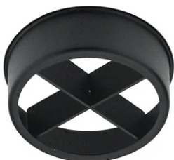
Screening crosspiece 08.8411.00