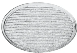
Elliptical lens 08.8163.68