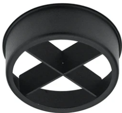
Screening crosspiece 08.8411.00