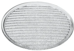
Elliptical lens 08.8163.68