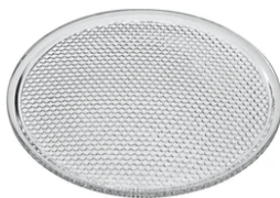
Flood lens 08.8175.68