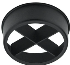
Holding ring 08.8410.00