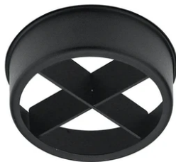
Holding ring 08.8410.00